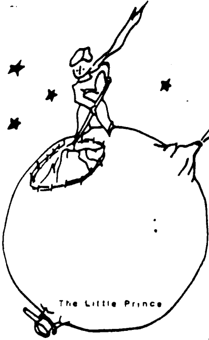
The Little Prince